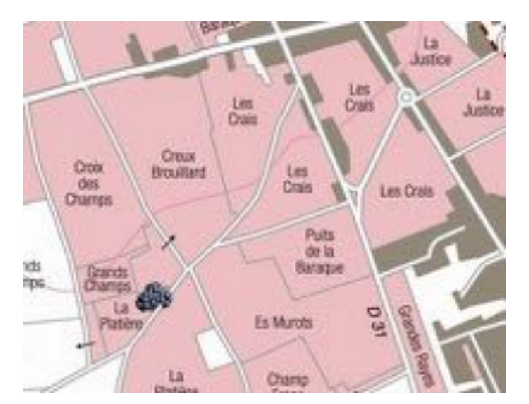
Area: 0,33 ha Age of the vines: 45 years old Average annual production: 1500 bottles Grape variety: Pinot Noir