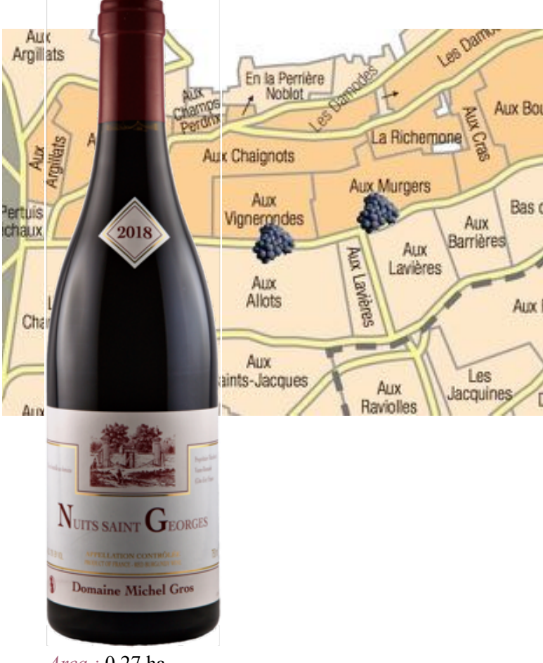
Area : 0,27 ha Age of the vines : 35 years old Average annual production : 1200 bottles Grape variety : Pinot Noir